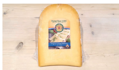
750 gram wedge