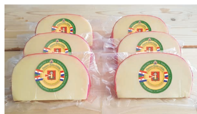
210 gram Edam wedge

We offer a wide range of cut and pre-packed cheese solutions. We have a large variety of smaller portions available ranging from half and quarter pieces to smaller retail packages of approximately 250 grams. In various forms, such as wedges, Swedish cut or kilo blocks. We use a modern packaging line and this allows the pre-packed cheese to have a long expiry date, while still offering an attractive consumer package. The packaging department is of course fully certified to guarantee excellent hygiene and quality.