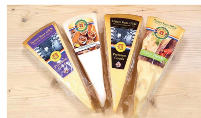
300gram swedish cut